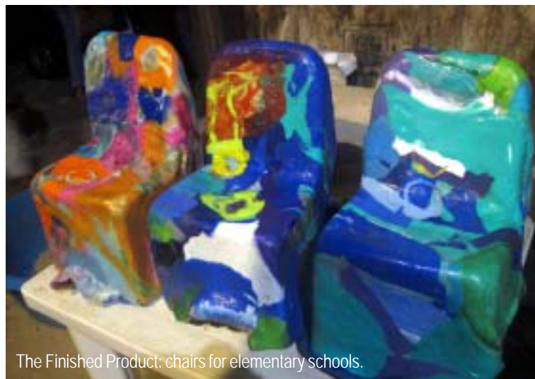
The Finished Product: chairs for elementary schools.