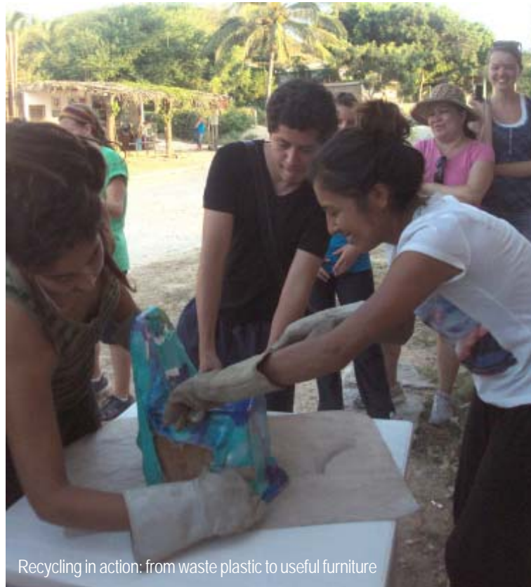
Recycling in action: from waste plastic to useful furniture

Also, recycled materials can produce truly useful products. As the photos show, these new products demonstrate success and very special results. As recycling continues increasing in amount and in quality, all consumers are going to benefit.