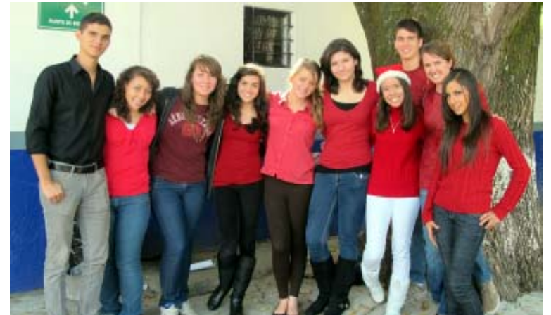
Lincoln Student Leadership (LSL) Members - the voice of Lincoln students