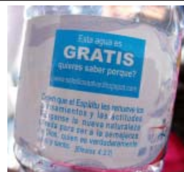
Water -- and a message