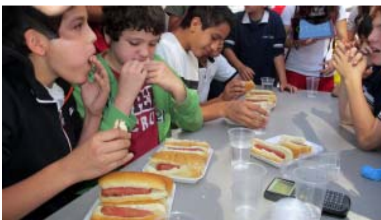
Hot dog eaters top out with a tie of seven hot dogs each during Kermess.