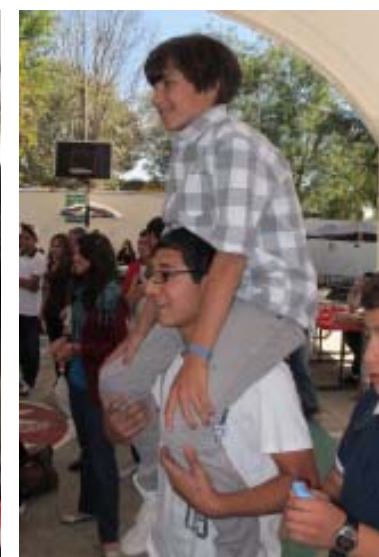
Whatever it takes to get a good view!