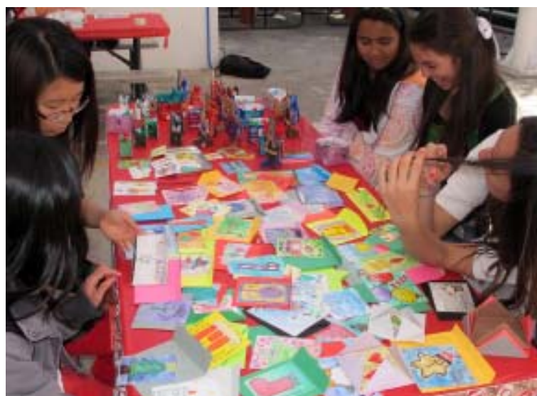
Crafts and artwork were also available at the school's 2011 kermess.